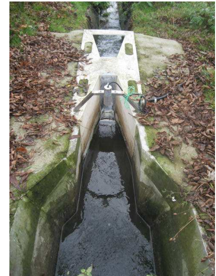
P5 - creek