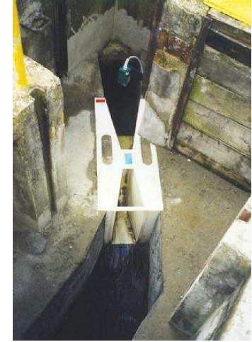
Waterfall and curve behind P3