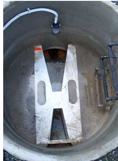
P2 in manhole DN 1000